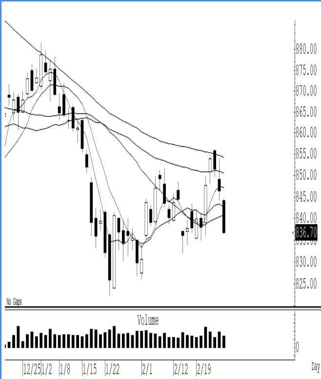
S50H24 (Close 836.70 Chg -9.70)